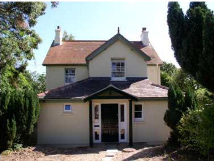
Rear Elevation, after

This project involved the refurbishment and extension of a 1909 house to provide an enlarged kitchen, dining area, cloakroom and larder, as well as internal alterations and re-ordering to provide a library, study and additional bathrooms. The works generally upgraded the property making it more suited to the clients' way of life.