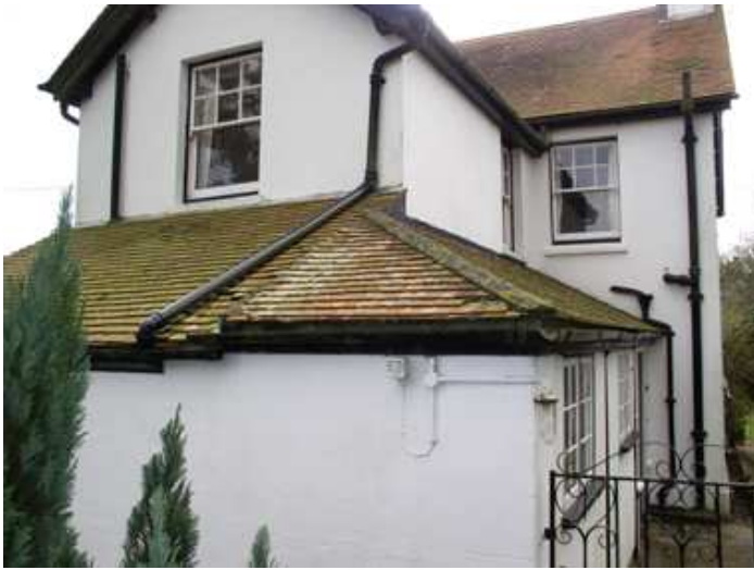
Rear Elevation, before

This project involved the refurbishment and extension of a 1909 house to provide an enlarged kitchen, dining area, cloakroom and larder, as well as internal alterations and re-ordering to provide a library, study and additional bathrooms. The works generally upgraded the property making it more suited to the clients' way of life.