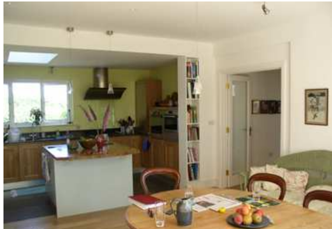
Dining Room looking into Kitchen

108a FISHERTON STREET, SALISBURY, WILTSHIRE, SP2 7QY