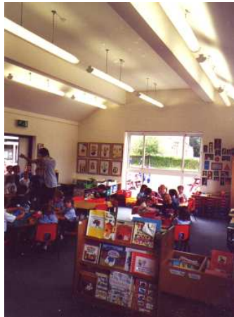
Classroom Extension Internal

The School soon needed the newly converted Staffroom as a Classroom, so we were asked to prepare a scheme to knock two rooms into one to create a new Staffroom. 2004.