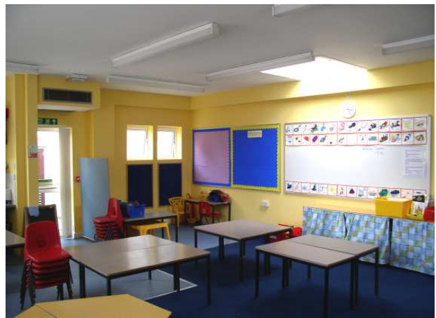
Kitchen to Staffroom to Classroom

Contract Value: £55,000 Contractor: Gaiger Brothers Ltd Structural Engineer: Wiltshire County Council Service Engineer: Wiltshire County Council